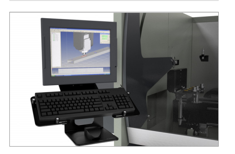
The pictures are provided by way of illustration only